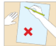
Paper position for right-handed children