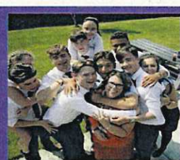
Childhood stroke resources Access a range of resources to support young people, families and professionals.