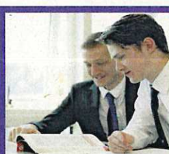
New toolkit Our new publication, Supporting children after a stroke, is a practical guide for teachers and childcare professionals.