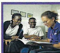
Childhood stroke Find out information about stroke in childhood, including causes and treatment.